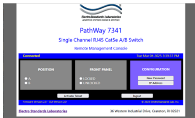
Figure 1: GUI in a Standard Web Browser

DeviceInstaller requires Microsoft's .NET Framework version 4.0 or higher. If the .NET Framework is not already installed, it must first be installed. The .NET Framework can be downloaded from Microsoft's website, either as a web install, or as a standalone installation. The latest version of DeviceInstaller can be downloaded from Lantronix's website.