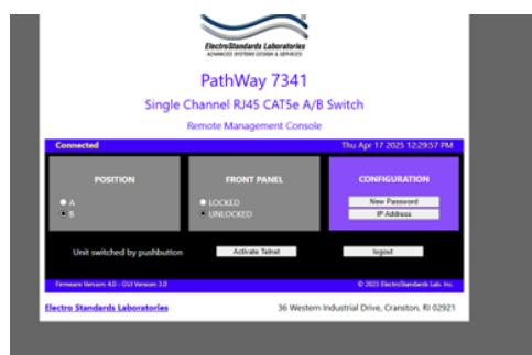
Figure 2: Logging into the GUI