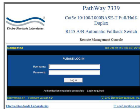
Figure 2: Enabled Log In prompting username & password.

When authentication is enabled, the GUI will prompt for the username and password to be entered before any operation can be done.