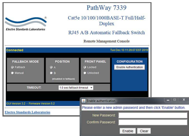
Figure 1: Enable Authentication.

There is no authentication enabled by default. Enable authentication by clicking the "Enable Authentication" button.