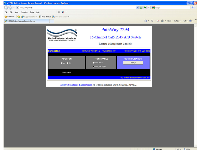
Figure 1: GUI in a Standard Web Browser

DeviceInstaller requires Microsoft's .NET Framework version 4.0 or higher. If the .NET Framework is not already installed, it must first be installed. The .NET Framework can be downloaded from Microsoft's website, either as a web install, or as a standalone installation. The latest version of DeviceInstaller can be downloaded from Lantronix's website.