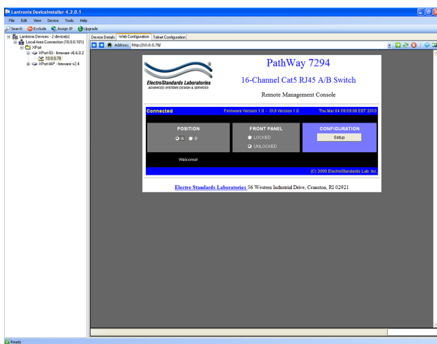
Figure 2: GUI shown in the DeviceInstaller.