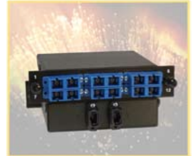
Model 6006 One 12-Fiber MTP/MPO male input break-out to 12 SC male outputs. (12 Simplex or 6 Duplex)