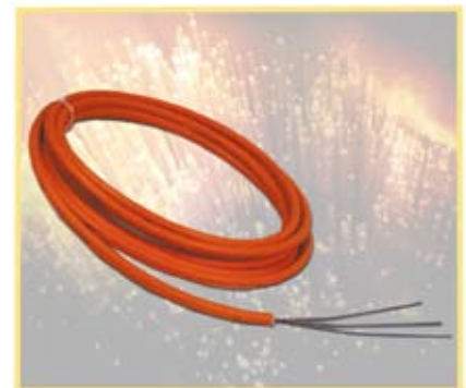
36-Fiber Crush Resistant cable utilized in trunk cables (three 12-fiber ribbons).