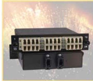
Model 6012 Two 12-Fiber MTP/MPO male inputs break-out to 24 LC male outputs. (24 Simplex or 12 Duplex)