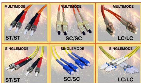
Figure 3A. Top row: demonstrates ST, SC, and LC multimode fiber optic cables. (orange jackets)